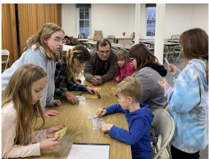
Ebenezer's Escape Room Challenge