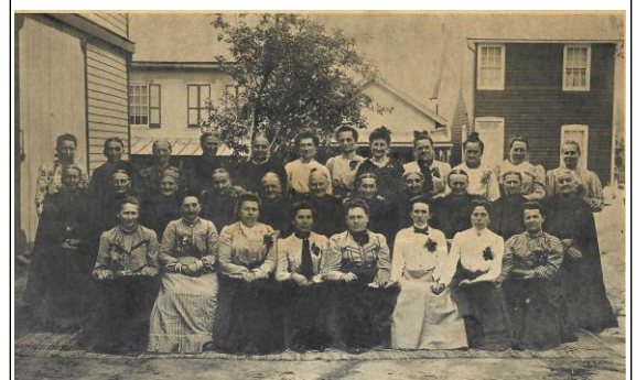
The Ladies Aid Society of Ebenezer Union Church circa 1911

(This photo's original includes the names of all of the women shown and is available for viewing in Pastor Wally's study.)