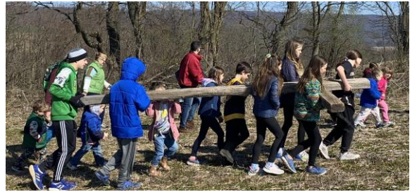
Good Friday Walk with the Cross