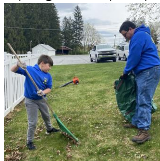
Thank you Cub Scouts!